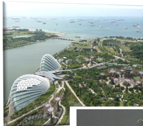
The Domes and what is inside